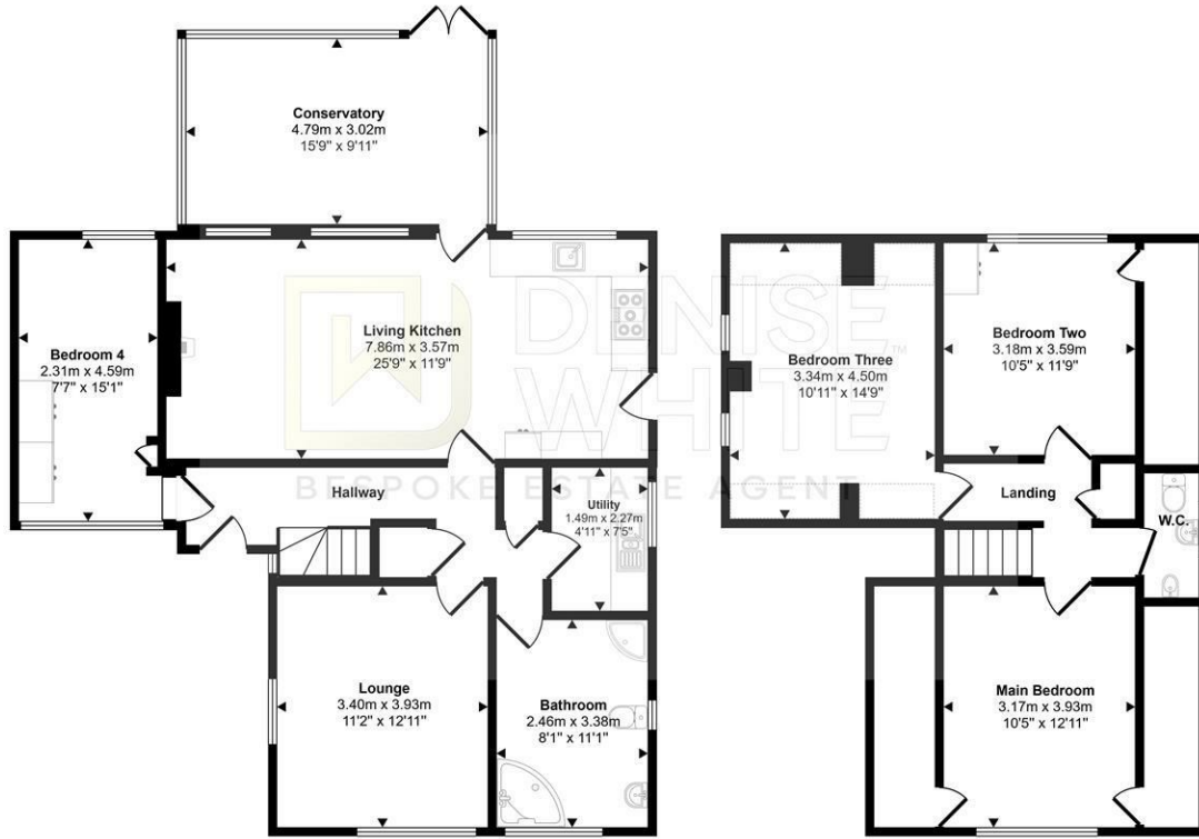
Ground Floor Approx 93 sq m / 1000 sq ft

Approx Gross Internal Area 153 sq m / 1649 sq ft